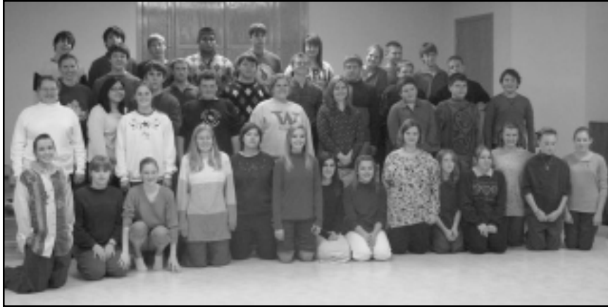
Winter Youth Retreat Participants dressed for a Soup Kitchen Meal

The theme for the Winter Youth Retreat was “Mission Makeover.” 45 youth and 12 adults were filled with the Spirit as we worked together in Christian service. We learned that the Lord has gifted us. He has given us special interests, experiences, relationships, and talents, and He wants us to use those for His service. Not just by giving to the needy and volunteering for projects, but each and every day. He wants all of us, all the time, sharing His love and sharing His Gospel.