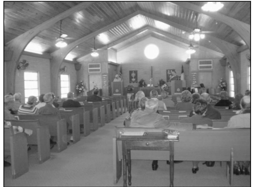
The 2010 Four-Church Fellowship Gathering (see story inside)